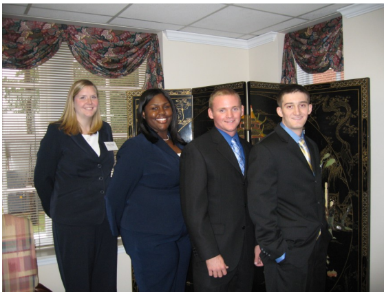
2008 Scholarship recipients—future CPAs

Tuition has increased 114% in the last ten years, up 11.1% from 2007/08 to 2008/09. It's time for the Alabama Society of CPAs to keep pace with the rising costs of education.